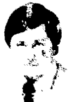
James J. Blanchard Governor